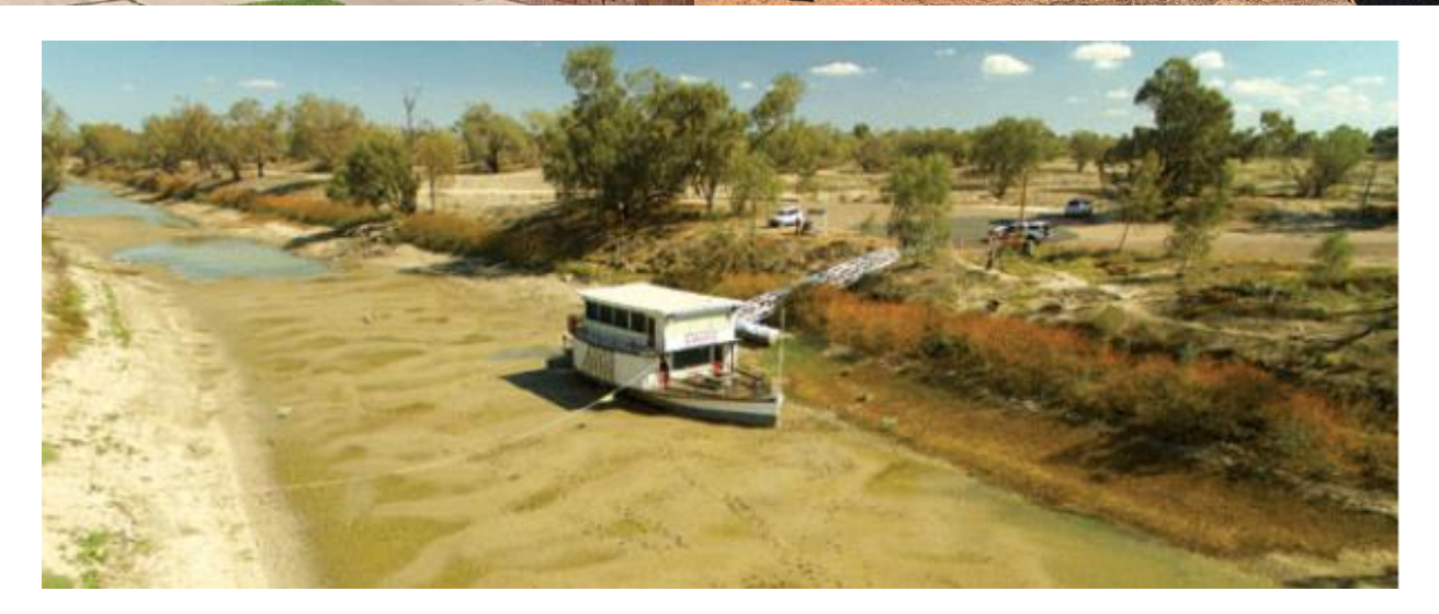
Above: The Darling River was at a low ebb due to the drought so unfortunately our cruise on the "Jandra" had to be abandoned.